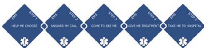
Figure 1 - Five Step Ambulance Care Pathway

The 5-step model is intended to ensure the ambulance service is providing the right response for a patient dependent on their clinical need.